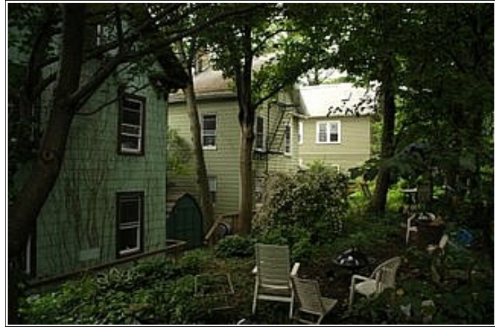
welcome and free of charge.

Consequently they started three second hand businesses in Staten Island, where they bought some houses close to each other. One selling used cloths, one furniture and utensils, one books and a company to move stuff from houses. They refurbish the furniture themselves. The book store meanwhile has transformed into a book cafe with evening (social-artistic-political) events.