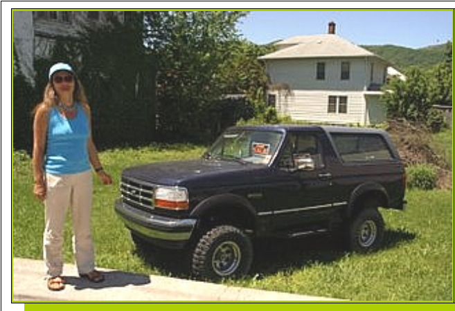
Cars and houses for sale!