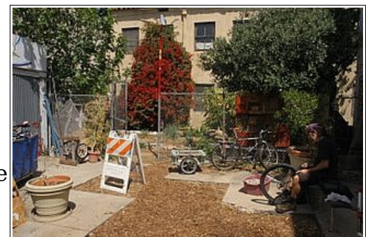
Concrete removal work

They pressed for a permeable sidewalk cover in a country where normally every inch is plastered with a thick layer of concrete; they managed to have Macademia nut trees planted on this sidewalk in contradiction to state policy to not plant fruit trees in the city; they had cork oak planted on a mayor through street; they ripped the pavement in front and around of their houses,