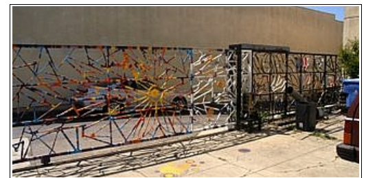
Gate from bicycle parts

They started in 1993 after the racial riots in LA. They took the decision to buy and retrofit houses in the neighbourhood where Lois lived. It was a poor area, with gang violence and much fear in the people. So one of the goals was to get neighbours feel safe and a sense of community. They organized meetings with “positive gossip” and created opportunities for people to meet. They shared about strengths and weaknesses of the neighbourhood. After some time of meetings crime was not the mayor focus anymore like in the beginning of these reunions.