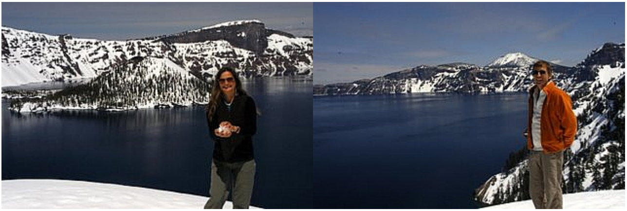
Snow at Crater Lake, Ca.