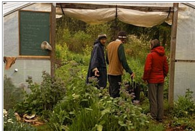
Greenhouse at Lost Valley Community