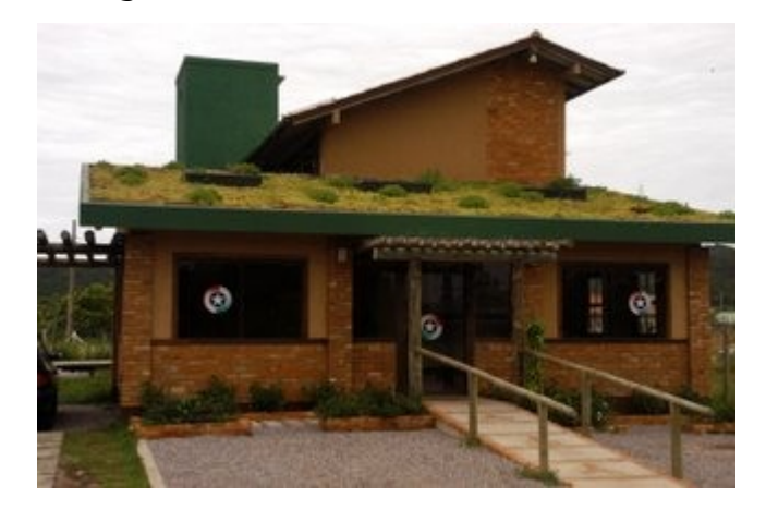
"green" police station from recycling material

We were shown many fantastic buildings from almost 100% recuperated materials like this police station. Of course the wood taken from old buildings is tropical, hard, heavy and beautifull. And of course they do not need to think about insulation or air tightness.